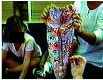
Figure 1a. Floral dress.