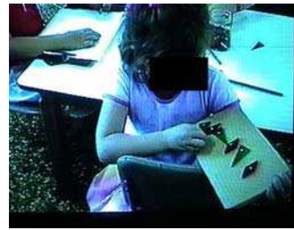
Figure 2b. Child-initiated patterning activity.

The three teacher-initiated experiences required the children to identify and create AB patterns. These consisted of transition activities that had a patterning component, namely numbering off in pairs before moving, sitting in a girl-boy sequence on the carpet, and identifying word patterns in songs. It was evident that Linda provided the class with various opportunities to develop an understanding of the AB form of patterning.